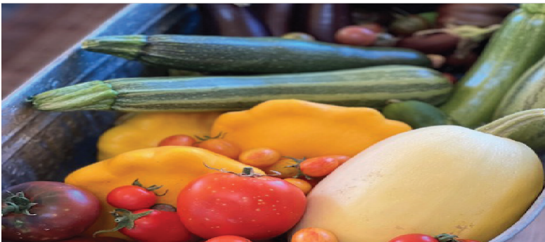
Evers's vegetable harvest

"I see, within myself and my peers, this nostalgia for the homemaking skills that our grandmothers and mothers had. We want to master these skills, not out of necessity but just out of the desire to